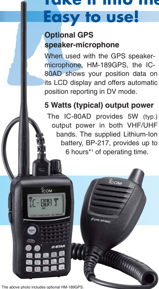
The above photo includes optional HM-189GPS.